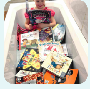
Ivy Y1Junior Y1Mrs AllenbyCongratulations to everyone who entered. You all showed some excellent 'Extreme Reading'